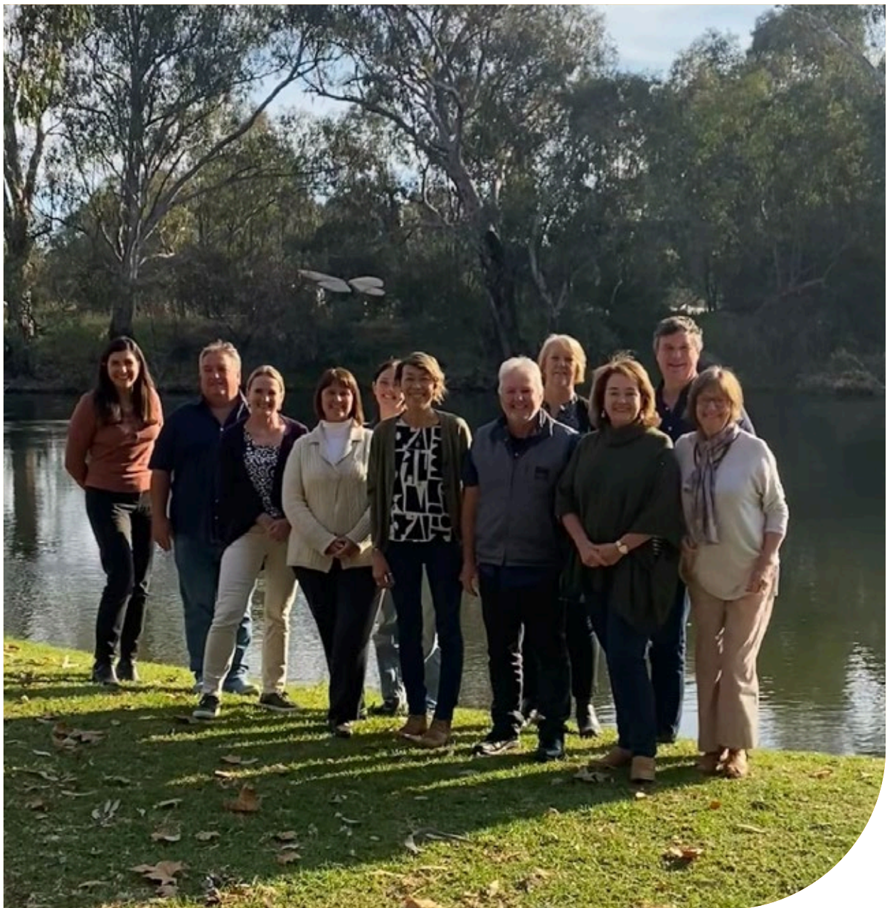
Community Foundations Australia Network Gathering 2024 hosted by Community Foundations Australia with Border Trust.

As a proud member of Community Foundations Australia and Philanthropy Australia, Border Trust benefits from strong leadership and governance support. The valuable networking, collaboration and learning activities offered throughout the year enable Border Trust to make informed decisions and grow our support of life-changing initiatives that create a thriving and inclusive region.